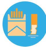
cigarettes & butts