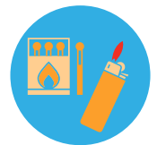
lighters & matches

Matches, lighters, lit cigarettes and faulty vaping devices can cause serious burns, injuries and house fires .