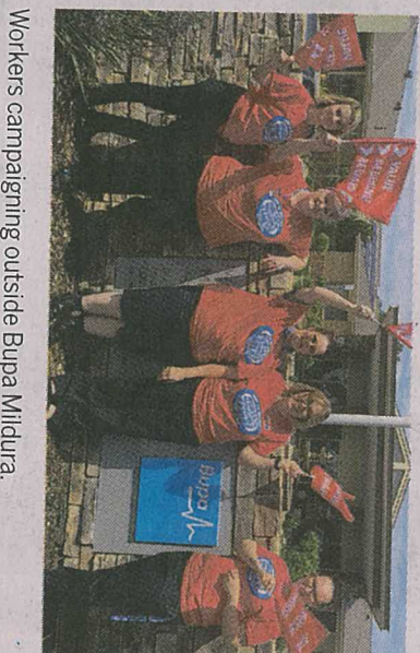
Workers campaigning outside Bupa Mildura.

"Nurses and carers will be reluctantly stopping work and will ensure this action does not affect the health or welfare of the people in their care."